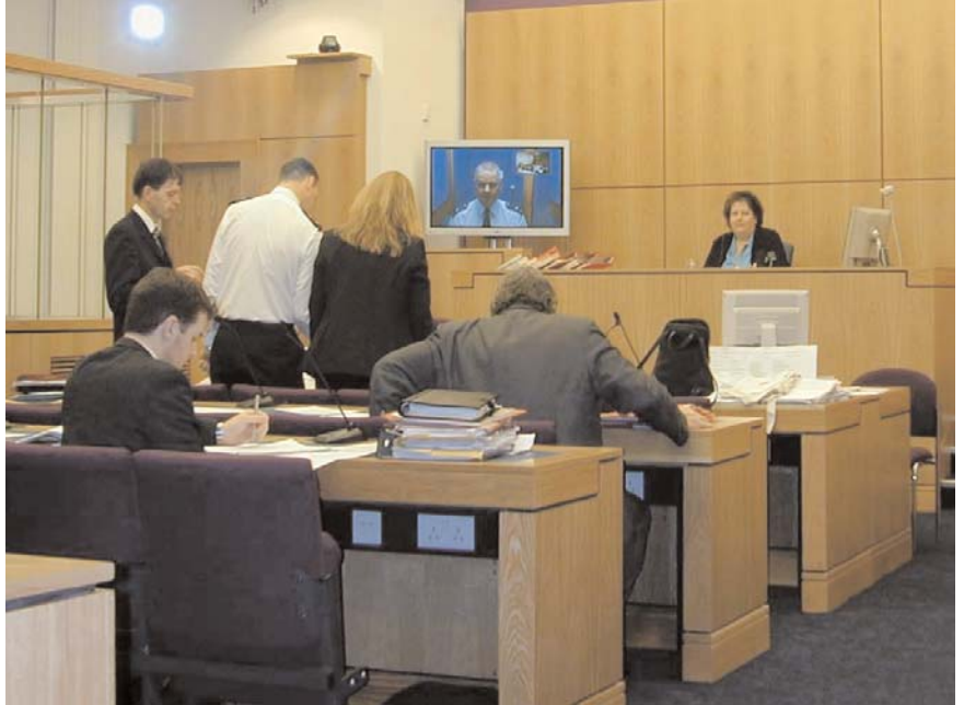
TANDBERG video systems help the Northern Irish courts and prisons function smoothly